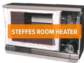
STEFFES ROOM HEATER

With regional cash propane prices around the $2 per gallon mark, we want to remind you about our low cost dual fuel heating rate. To put it into perspective, 6.1¢ electric is the equivalent of $1.50/gal propane (in a 90% efficient furnace)! Dual fuel is certainly a value you should consider.