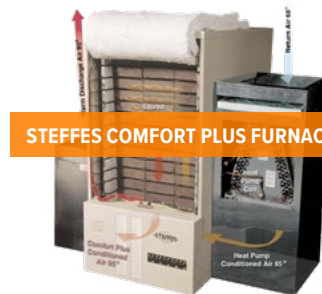
STEFFES COMFORT PLUS FURNACE