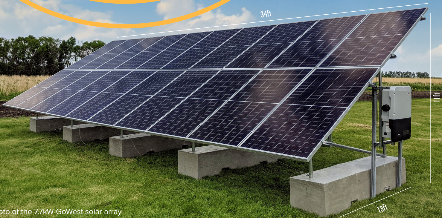
Field photo of the 7.7kW GoWest solar array

GoWest Solar is a pioneering effort to increase the value of solar energy. The solar array is aligned at 240° to the southwest, optimizing electricity production during summer evenings when electric demand is high and market value is greatest.